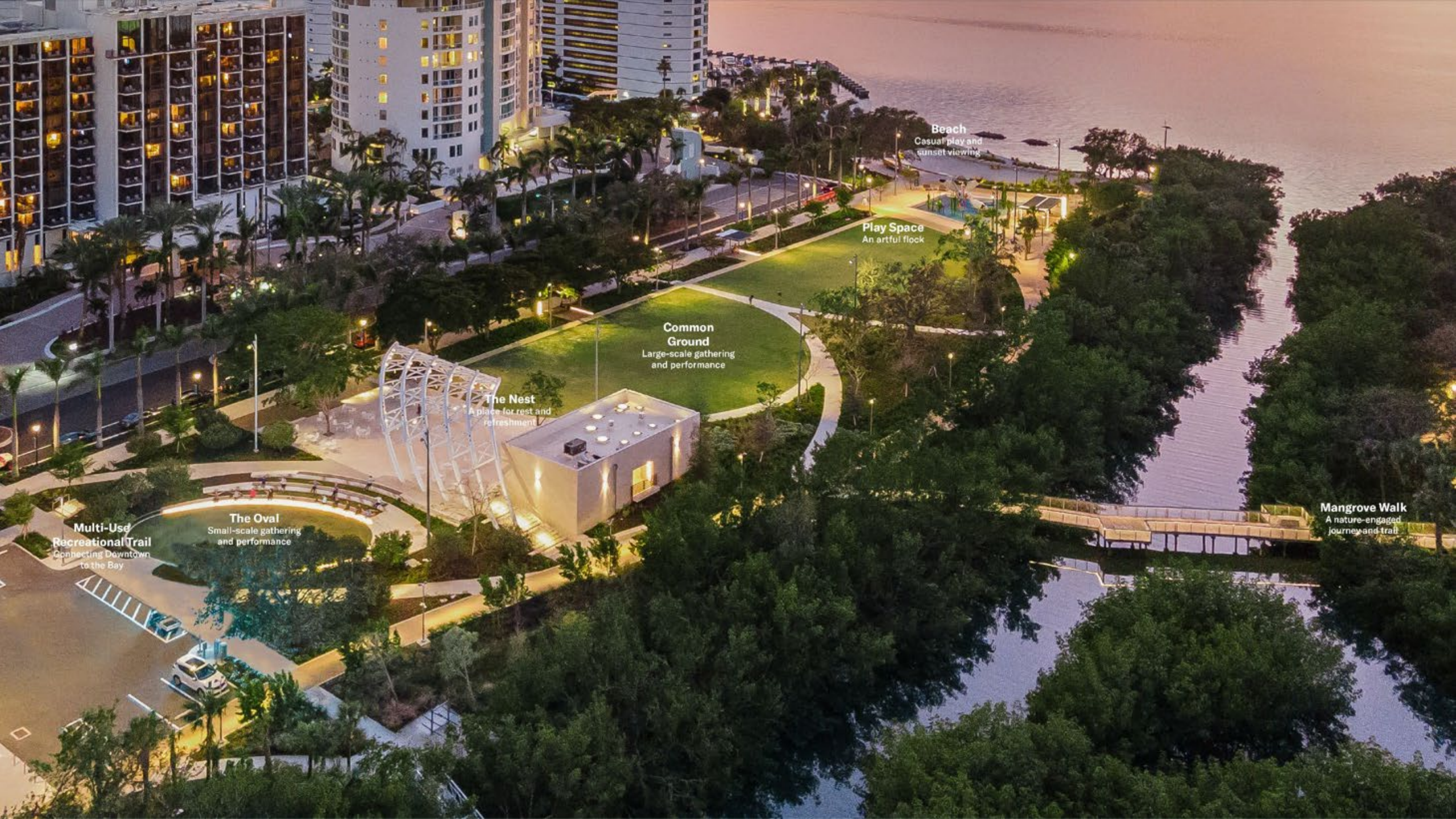
Beach Casual play and sunset viewing